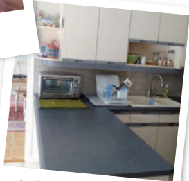
kitchen - before

"After construction started, we were kept informed of the renovation progress, but did not have to worry about anything!"