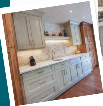
kitchen - after