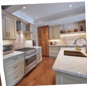
kitchen - after