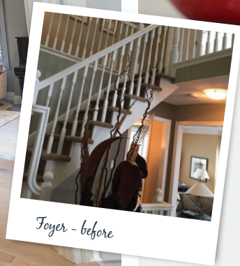
Foyer - before