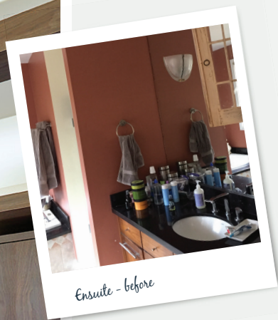
Ensuite - before