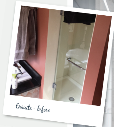
Ensuite - before